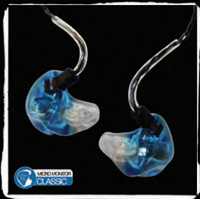
Micro Monitor Classic Transparent Blue