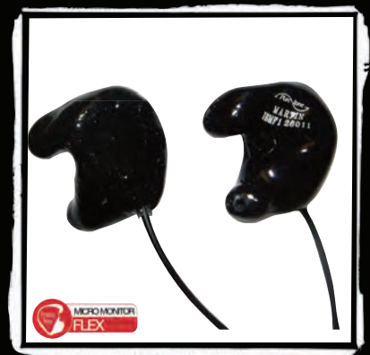
Micro Monitor Flex Black