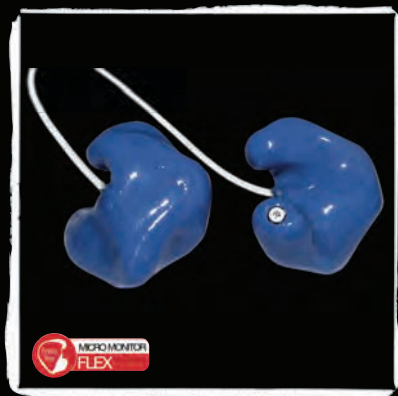
Micro Monitor Flex Blue