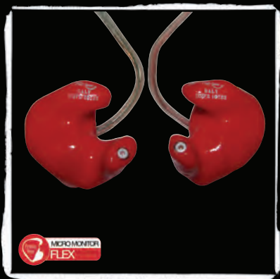
Micro Monitor Flex Red