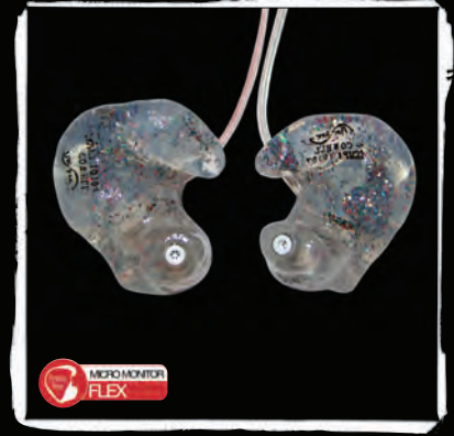
Micro Monitor Flex Transparent With Glitter