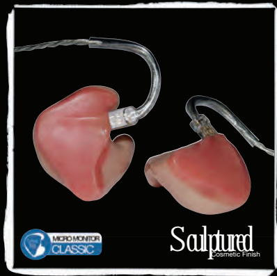
Micro Monitor Classic Sculptured Cosmetic Finish