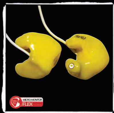
Micro Monitor Flex Yellow