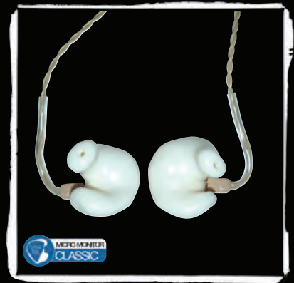
Micro Monitor Classic White