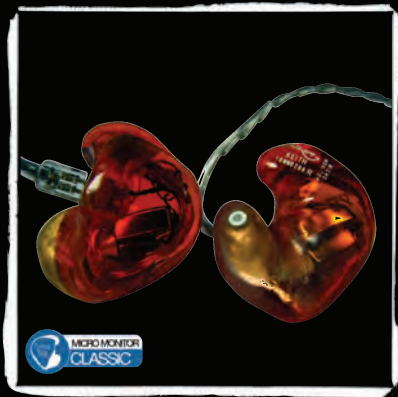
Micro Monitor Classic Transparent Red